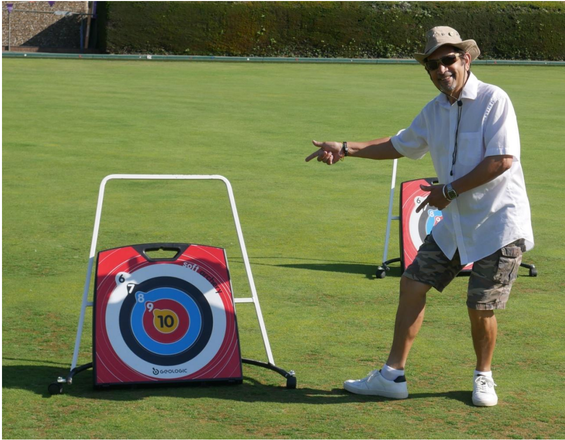
Another new event was the archery competition which proved very popular, as did the usual putting competition.