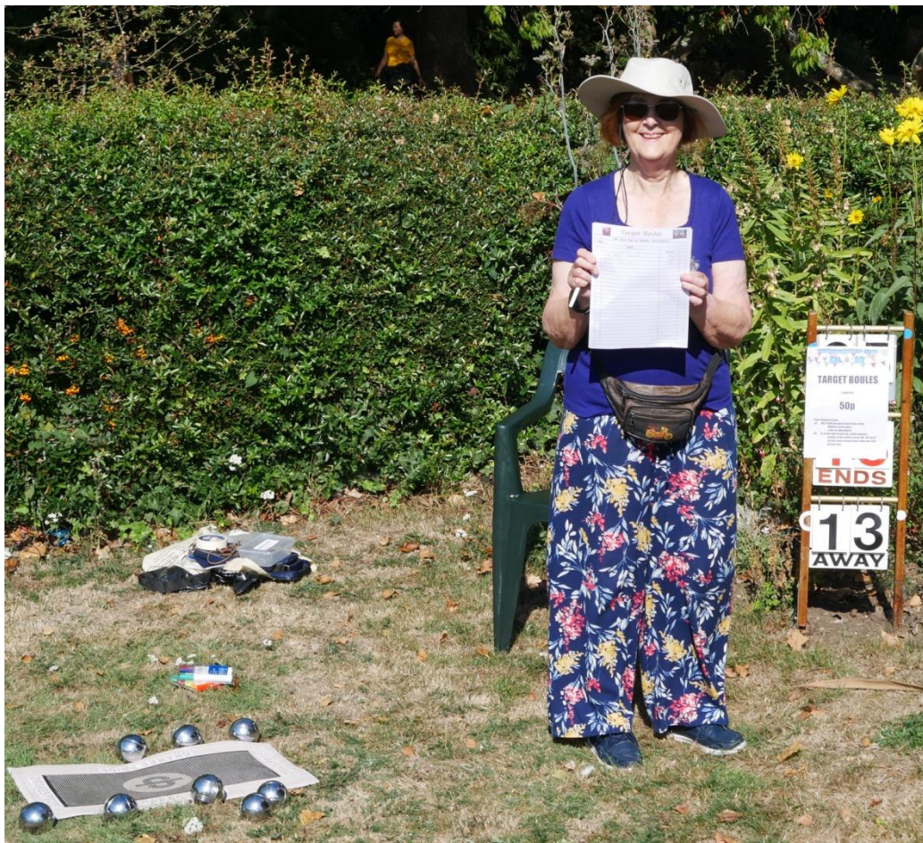
Boules on somewhat bumpy ground!