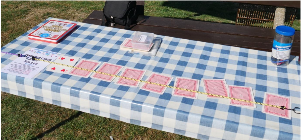
Satnam's stall neglected while he photographed it!