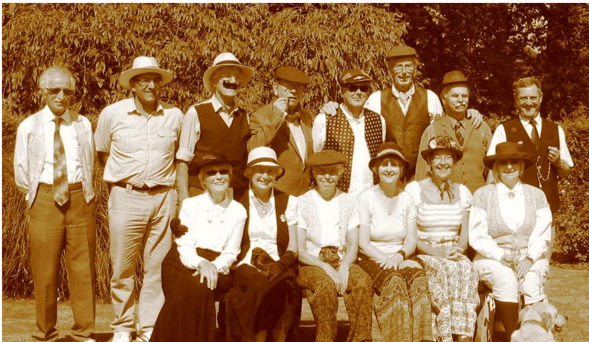
10 years ago we even dressed accordingly and took the pictures in sepia!