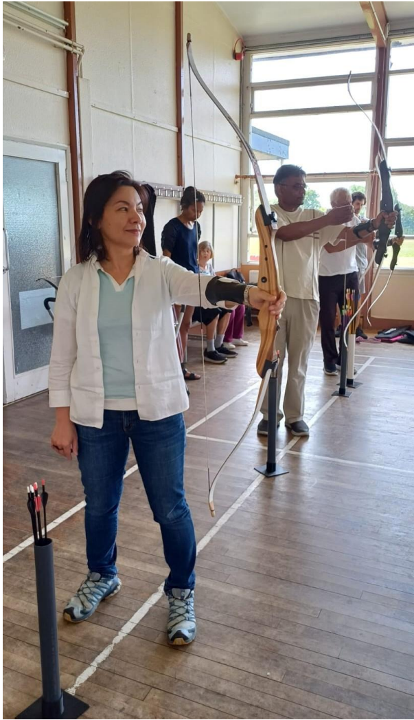
At the ready!