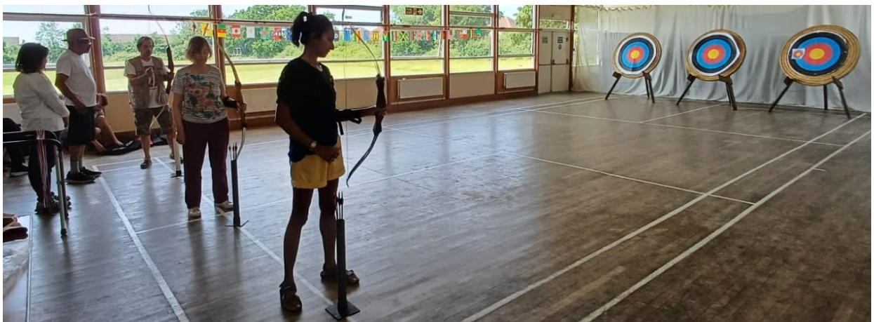
Not the jack this time but the bull!