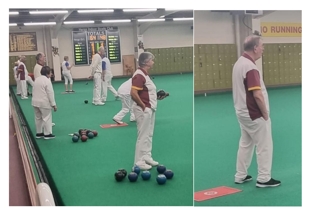
A crowded green.